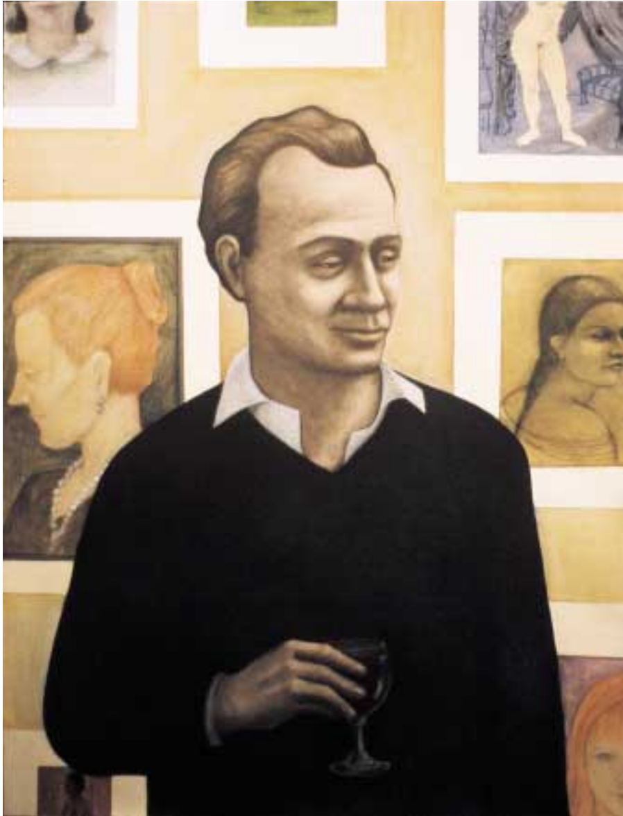
Duke 2002 charcoal and gouache on paper 50" x 38"