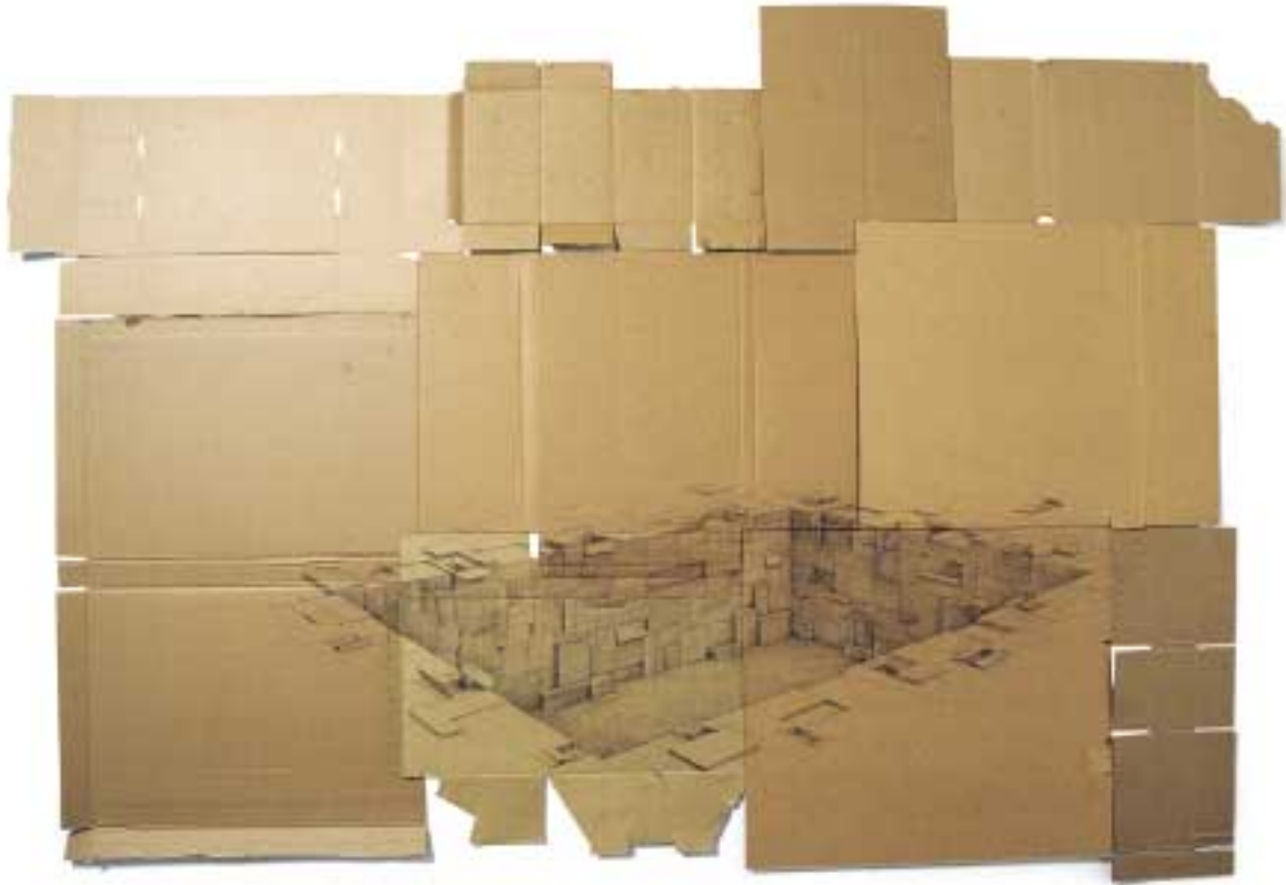
Redoubt 2002 colored pencil on cardboard 92" x 150"