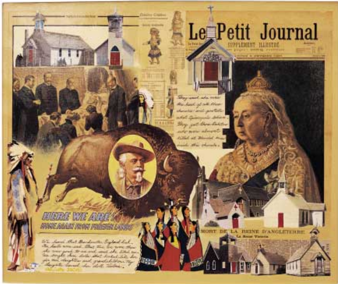
Defender of the Faith 2001 acrylic collage 24" x 26"