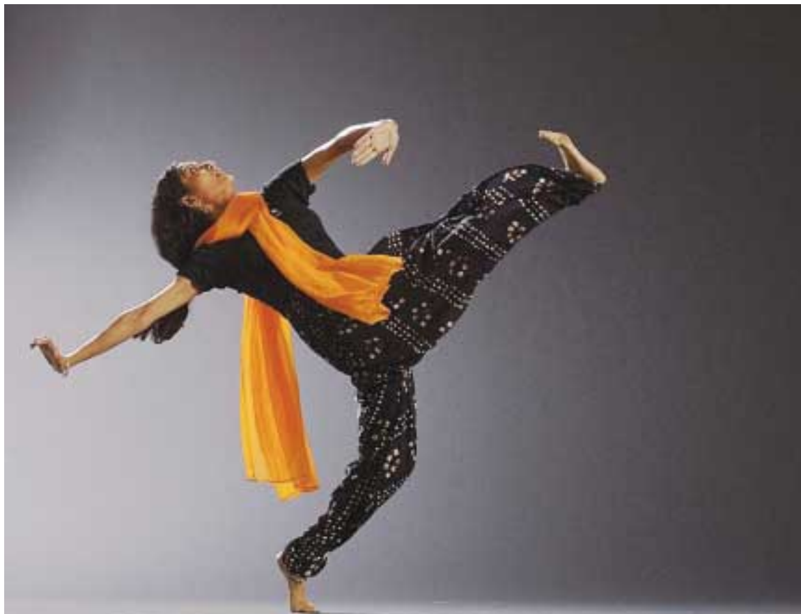
Making Rain premiere Habitat Center, Delhi, India, July 31, 2002