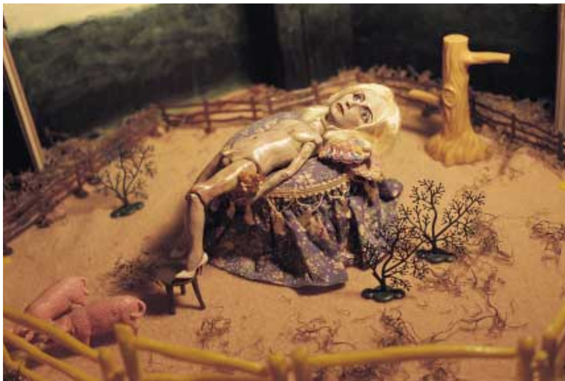
Outdoor Scene 2001 (detail) raku, glazes, and mixed media 22" x 34" x 31"