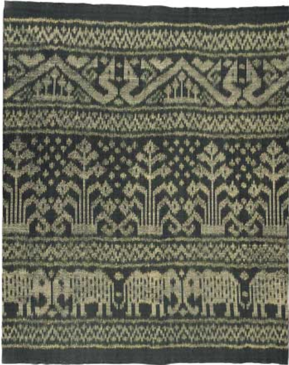
detail from Symbols of Peace & Prosperity 2001 Met-mee (Ikat) process, hand-spun silk/cotton 22" x 44"