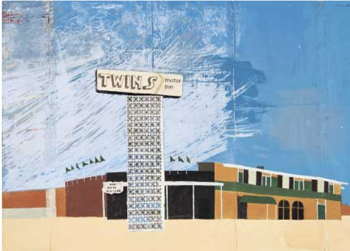
Twins Motor Inn, St. Paul 2002 acrylic and pencil on paper 21" x 29"