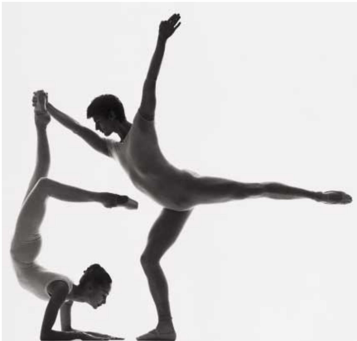
James Sewell Ballet