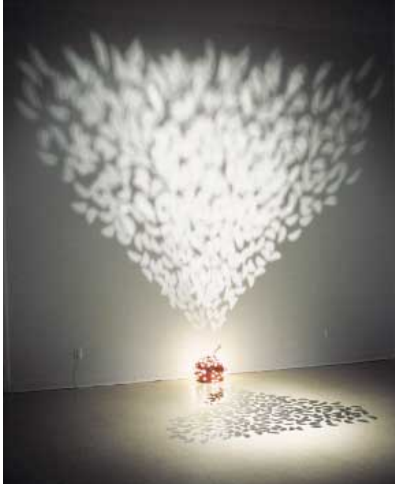
"...he shut his eyes, he opened his eyes." (for Flannery O'Connor) 2000 mirrors, glass lenses, fiber optics, latex paint, gas can, and Christmas lights 12' x 14' x 6'